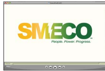
30 Second TV commercial and video announcing new logo