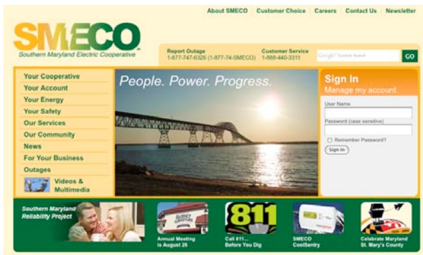
Web site design