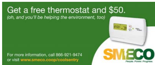
Billboard layout design