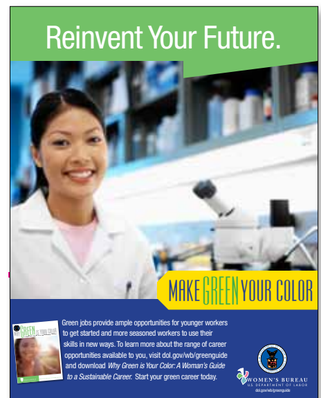
Women's Bureau Poster