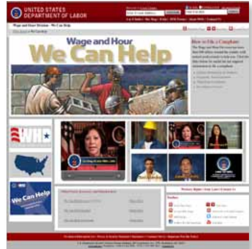
We Can Help web microsite with interactive U.S. map and videos.

"The Wage and Hour Division has received incredible graphic design work and responsive service from the entire staff at Slice. They have creative ideas and are willing to accommodate any request. The company designed many components of our national public awareness campaign "We Can Help", various recruiting fliers, and a 70th anniversary commemorative booklet for the establishment of the agency. I looked forward to seeing their proofs whenever they took on a new project."